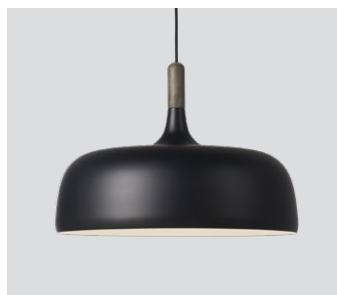
Acorn white – Item no. 540